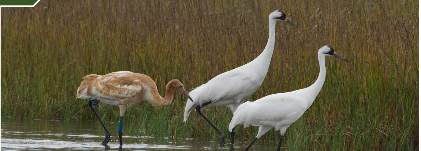
Whooping cranes in the Aransas National Wildlife Refuge in Texas